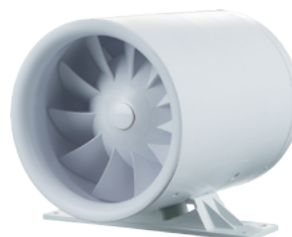
Ducto-U – fan with a fixing bracket for flat surface mounting